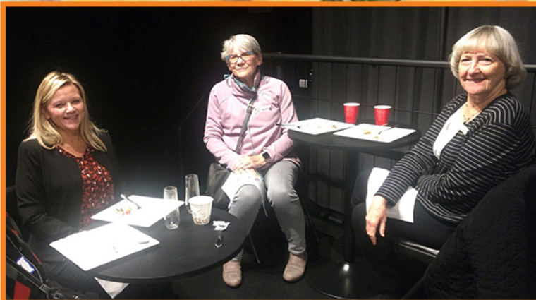
Time was well spent making new and renewing old friendships in the Open Stage Court Street Cabaret and Studio Theater areas which had been set up for our dining pleasure.