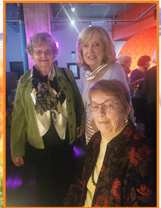
Our faces show how very enthused we were to be out and about again. The whole affair received unanimous approval from all members in attendance.